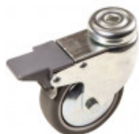
S7001014 set of 4 wheels for workshop tables