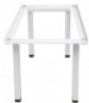
A66100 baseframe for knock-down-welded lockers, 300