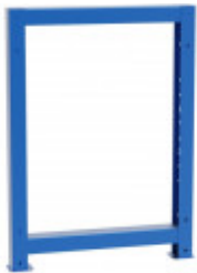
S04102030 leg firm