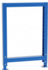
S32100100 leg height adjustable